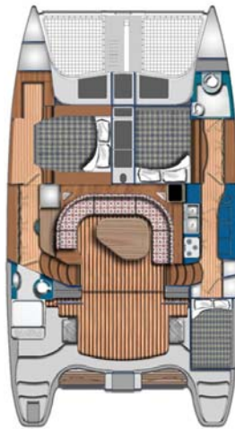
Three Cabin Island Bed