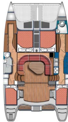
Four Cabin Standard (Island Bed Available)